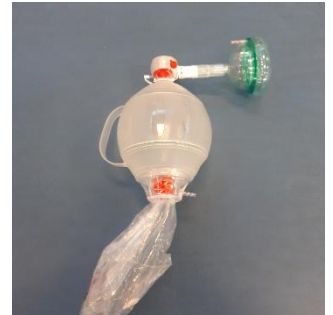
Correctly assembled equipment

This will be assembled for use by your physiotherapist.