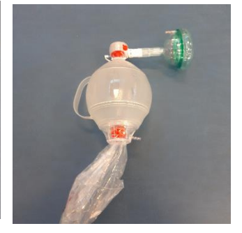
Correctly assembled equipment